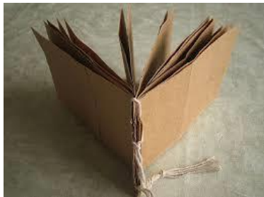
Paper bag book

Test your knowledge of science principles and see if you can make a paper bag kite! Decorate it as you desire and consider the following: What makes it float? How can you improve your design? Can your kite be a parachute for a toy if it were launching from a chair or a bed?