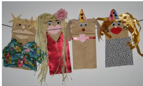
Paper bag puppets photo by Julie Meloni: https://tinyurl.com/yd215w3k